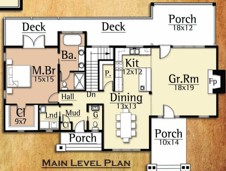
MAIN LEVEL PLAN

AREA CALCULATION: MAIN LEVEL: 1,458 S.F. LOWER LEVEL: 1,427 S.F. TOTAL: 2,885 S.F.